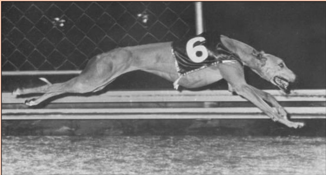
1968 Winner the mighty Zoom Top

1957 Idle Sign , 1958 Ebony Minda , 1959 Super Samson , 1960 Constant Raider , 1961 Elsie Moss , 1962 Black Top , 1963 Miss Warcroft , 1964 Revival King , 1965 Daily Tide , 1966 Sunset Fire , 1967 Another Glitter , 1968 Zoom Top , 1969 Beau Brin , 1970 Size Seven , 1971 Romantic Top , 1972 Likely Light , 1973 Trella Light , 1974 Busy's Chief , 1975 Mighty Aussie , 1976 Palaver , 1977 Fine Arama , 1978 Oberon Lily , 1979 Lord Raleigh , 1980 Glider's Son , 1981 Promises Free , 1982 Winifred Bale , 1983 Winston Lass , 1984 Beach Rhythm 1985 Another Flash , 1986 Memories Gate , 1987 See Yah , 1988 Grizzly Bear , 1989 Jessica Kate , 1990 Dixie Lass , 1991 Little Denver , 1992 Iago , 1993 Leon Mal , 1994 Zazziam , 1995 Nine Inch Nails , 1996 Tamborine Dancer , 1997 Elle's Commando , 1998 Waiwera Marika , 1999 Stately Bird , 2000 Some Secret , 2001 Suellen Bale , 2002 Modern Assassin , 2003 Winsome Shot , 2004 Kobble Rock 2005 Pure Octane 2006 Suave Fella , 2007 Leprechaun Pace , 2008 One Tree Hill , 2009 Cindeen Shelby , 2010 Lochinvar Marlow , 2011 Fancy Will and 2013 Sheikha , 2014 Iona Seven , 2015 Dyna Villa and 2016 Asa Flying Spur .